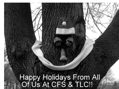
Happy Holidays From All Of Us At CFS & TLC!!